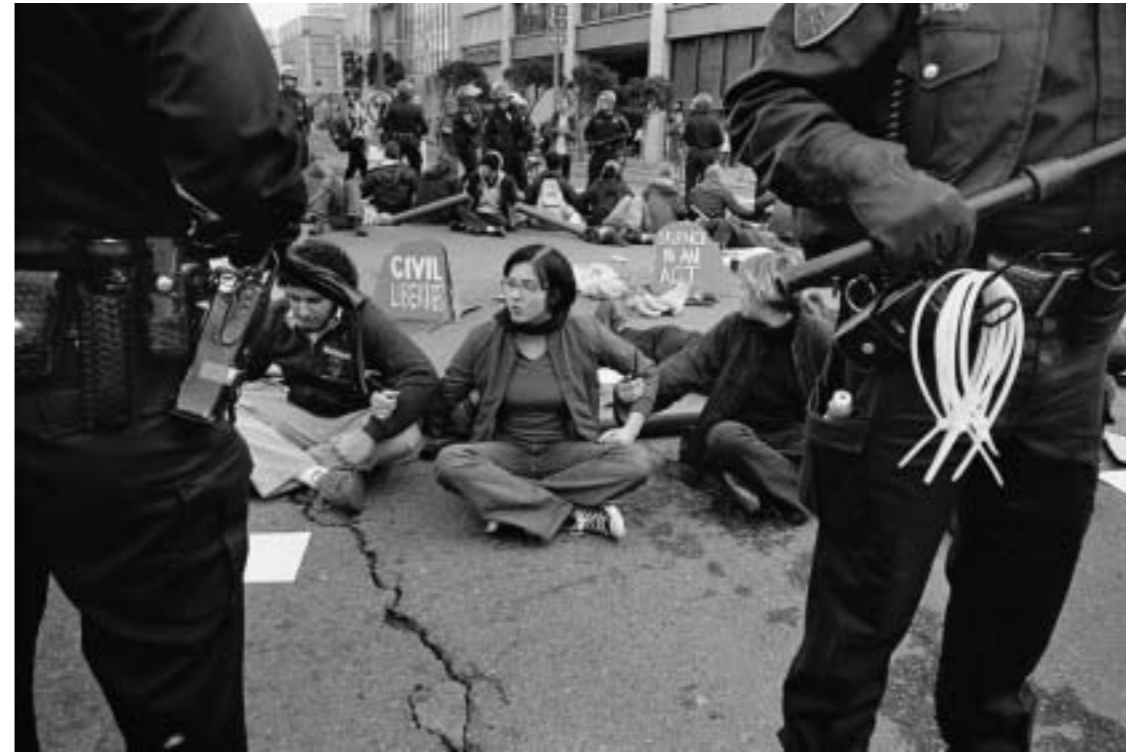
7 AM BLOCKADE ON VAN NESS , one of San Francisco's major streets. Protesters, most of them very young, linked arms and sat down on the street. The protests on the first day of war continued all day, leading to over 1,000 arrests. San Francisco, USA. 20 March 2003.