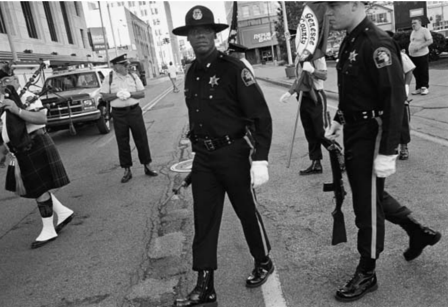
REMEMBERING 11 SEPTEMBER , 8 am. The police guard of honour get ready for a short procession through the town centre of Flint, to honour the victims of the attack on the World Trade Center on 11 September 2001. Flint, Michigan, USA. 2002.